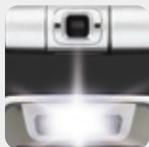
Rotating Camera Lens and Flash